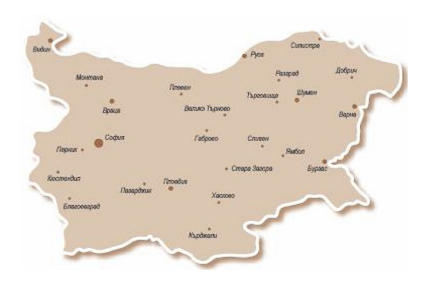
Allocation and number of Private Enforcement Agents /163/ on the territory of the Republic of Bulgaria according to judicial regions of activity