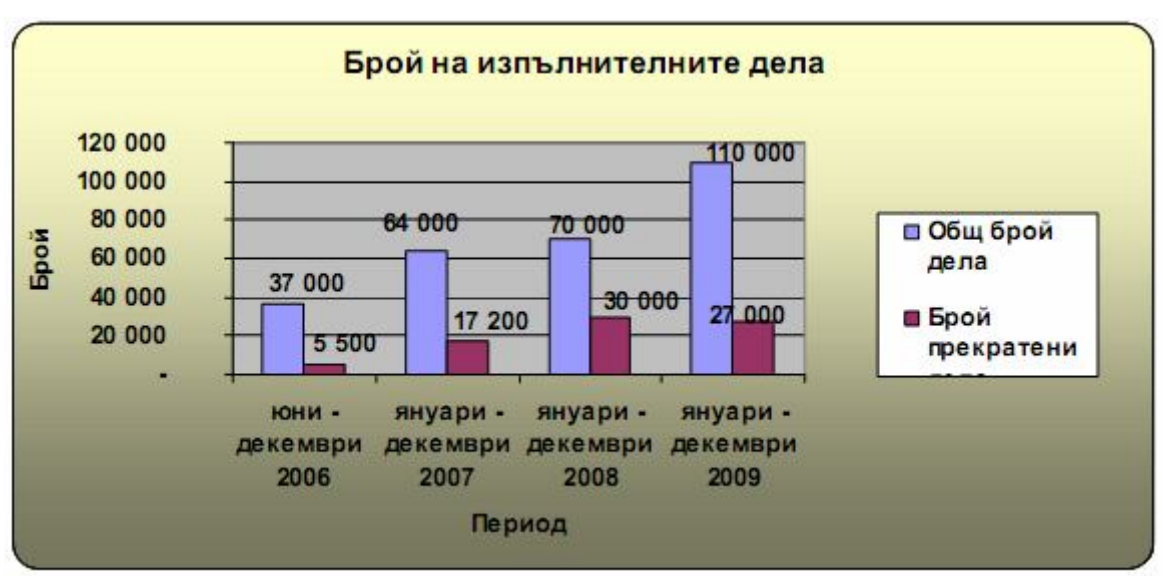
Number of enforcement cases

A little more than four years have passed since the introduction of the private enforcement in the Republic of Bulgaria. The results are eloquent - initiated cases in 2006 - 37\ 000 ; in 2007 - 64\ 000 ; in 2008 - 70\ 000 ; in 2009 - around 110\ 000 . Completed cases in 2006 - 5\ 500 ; in 2007 - 17\ 200 ; in 2008 - 30\ 000 ; in 2009 - around 27\ 000 . The collected funds are as follows: for 2006 - 95 million BGN; for 2007 - 250 million BGN; for 2008 - 400 million BGN; for 2009 - around 320 million BGN. (Note: the data for 2009 are approximate, on the basis of the reports on a 6-month and the preliminary data for the whole year submitted by the PEA).